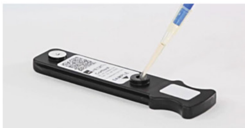
2 Load Patient Sample