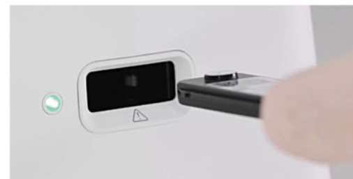
3 Insert Cartridge